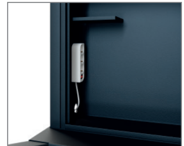
Lockable media cabinet