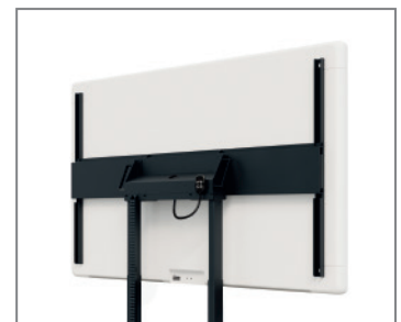
Hole pattern display-specific optimised